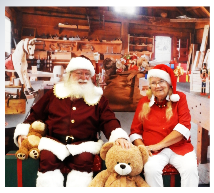
old. Smiles on their faces and in their hearts are priceless.

In your wildest dreams, what would you like to do as Santa, Mrs. Claus, or an elf? I want to ride in on a Zamboni, not a fire truck, not a float in the Macy's Thanksgiving Parade.